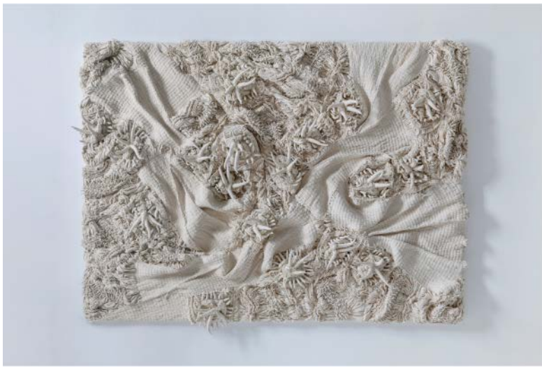
She' s Scenery No.2 她的景色 二

Cotton cloth, Cotton thread, Wood 棉布、棉线、木