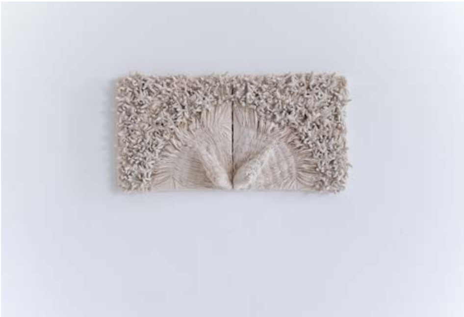
She's a little wave No.1&2 她的小浪花 1、2

Cotton cloth, Cotton thread, Wood 棉布、棉线、木