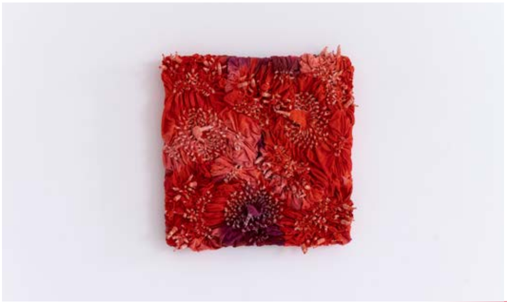
She's red moving no.3 她的红色流动 3

Plant-dyed Cotton, Cotton Thread, Wood 植物染色棉, 棉线, 木