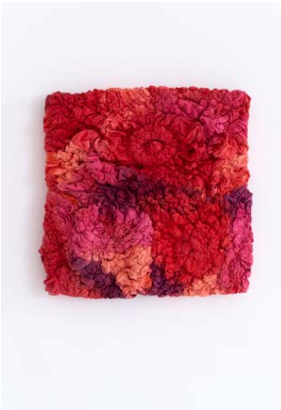
She's red moving no.4 她的红色流动 4

Plant-dyed Cotton, Cotton Thread, Wood 植物染色棉, 棉线, 木