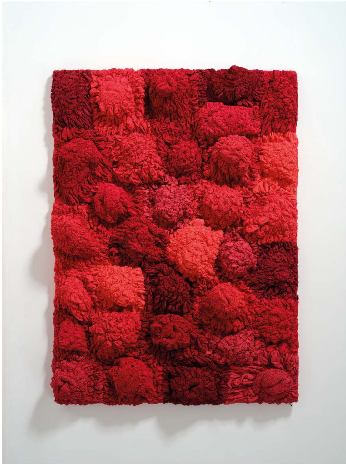
She' s fiery love. Plant-dyed Cotton, Cotton Thread, Wood 225 x 165 x 25 cm 2023