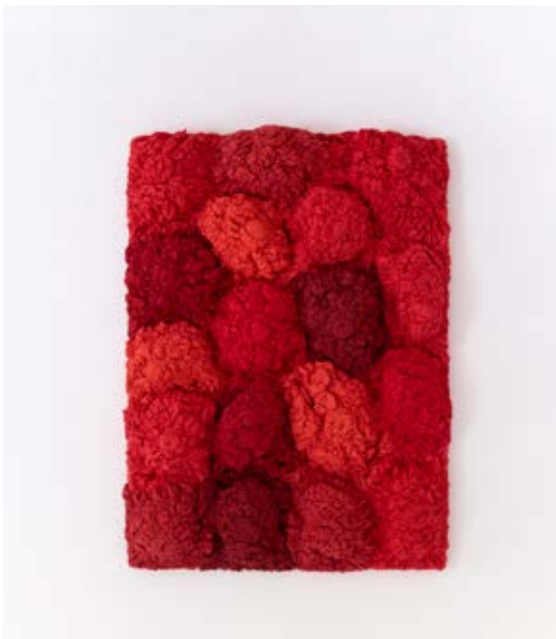
She' s red body 她的红色身体

Plant-dyed Cotton, Cotton Thread, Wood 植物染色棉, 棉线, 木