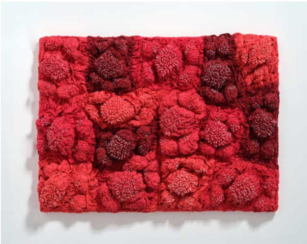
She's red body no.2 她的红色身体 2

Plant-dyed Cotton, Cotton Thread, Wood 植物染色棉, 棉线, 木