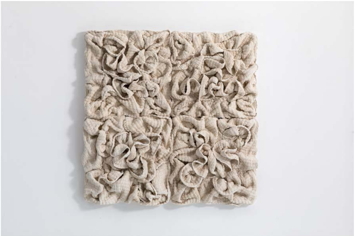
She's blooming no.9 她正在绽放 9

Cotton cloth, Cotton thread, Wood 棉布、棉线、木