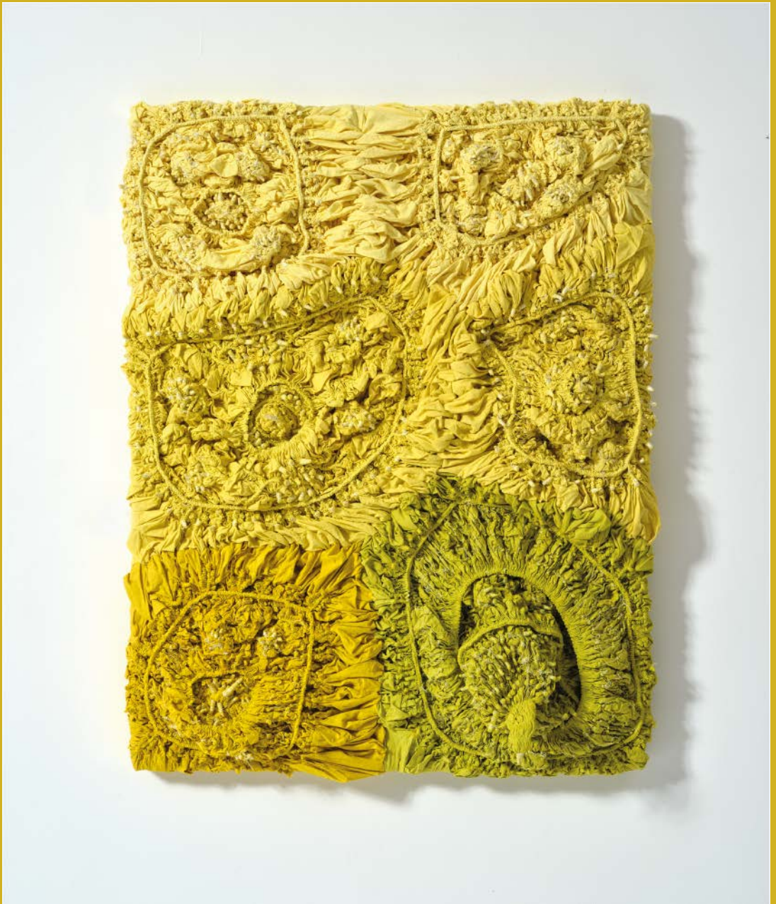
She' s yellow body. Plant-dyed Cotton, Cotton Thread, Wood 92 x 72 x 10 cm 2023