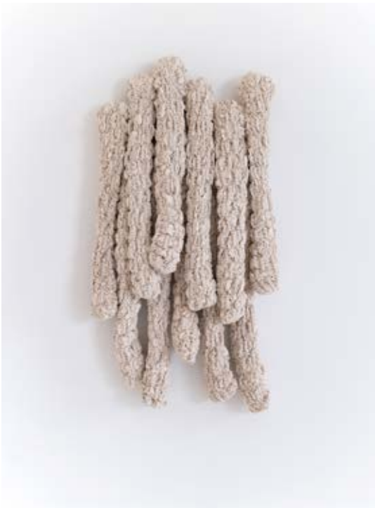
She's shadowno.1/2/3 她的影子 1,2,3

Cotton cloth, Cotton thread, Wood 棉布、棉线、木