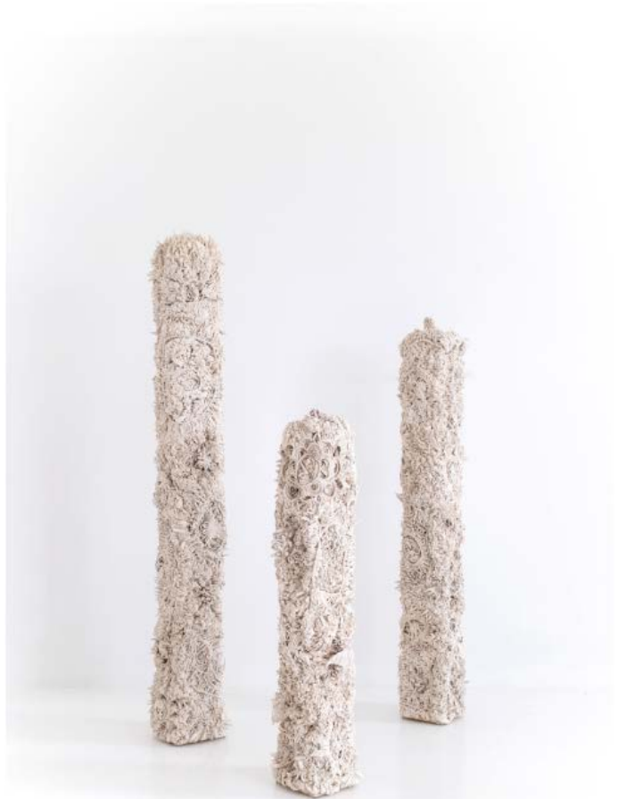
She's shadowno.1/2/3 她的影子 1,2,3

Cotton cloth, Cotton thread, Wood 布、棉线、木