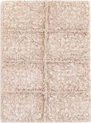
She's cake 她的蛋糕