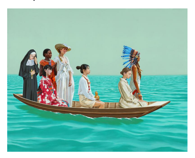
Tamen, Wonder women, 120x150cm, 2020

We yet have to discover the new order and logic of things. Artists, however, with their heightened sensitivity are more prone to attune and reflect on the subtleties of alternative dimensions that surround them. The work you will see in