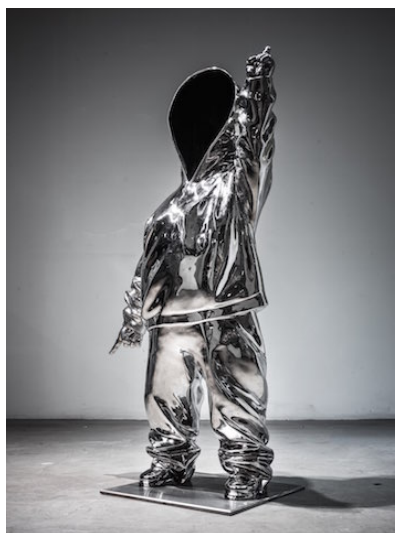
Huang Yulong 黄玉龙, Heaven and Earth 天地, Stainless Steel 不锈钢, 92 x 45 x 35 cm, 2018

Exhibition Duration: 28 th October – 30 th December 2018