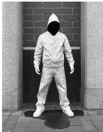
Huang Yulong 黄玉龙, Existence 存在, Bronze 铜, 2018